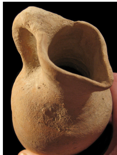
Old Testament vial

Ps 56:8 You have kept count of my tossings (To move restlessly or turbulently); put my tears in Your vial. Are they not in Your book?