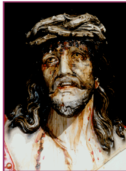
The Weeping and Bleeding Statue in Bolivia http://www.visionsofjesuschrist.com/weeping68.htm